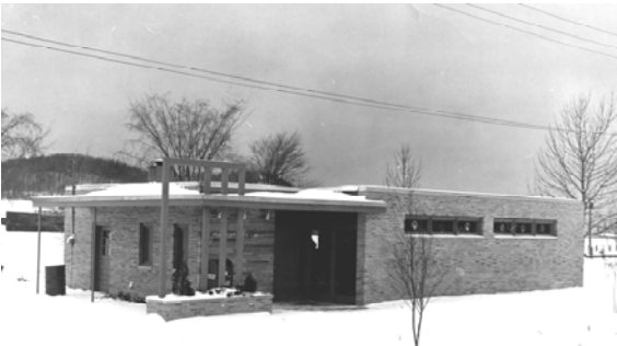
A BIT OF HISTORY ~ Frankfort Library 1994 ~ before addition added.

BLEAK HOUSE by Charles Dickens is a really rewarding classic. It is a great story full of all sorts of characters, good, bad, wrong intentioned and mismatched. It has, as Dickens always does, several subplots. The main story is the impact of a court case on the participants over the course of several generations and the impact of false hopes. If you are in the mood for a classic, you can't go wrong with BLEAK HOUSE .