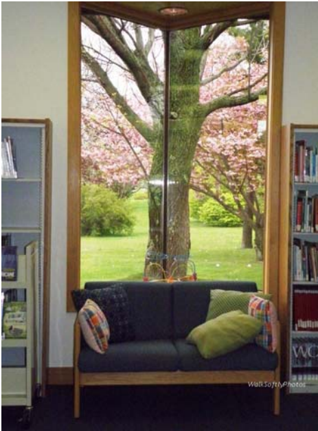
A cozy corner in the Children’s Area.