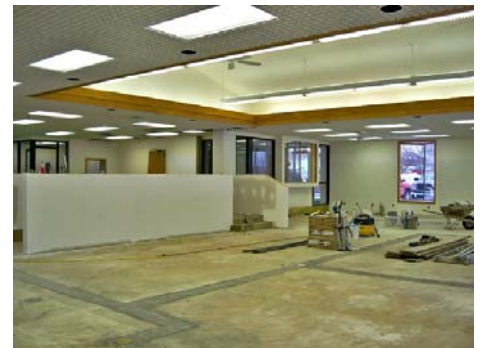
Shelves, shelves and more shelves to pack up. Thank goodness for all the help! Photo of David's Harborside on Main Street, Frankfort, which served as the library's temporary space. How exciting, the library is taking shape.