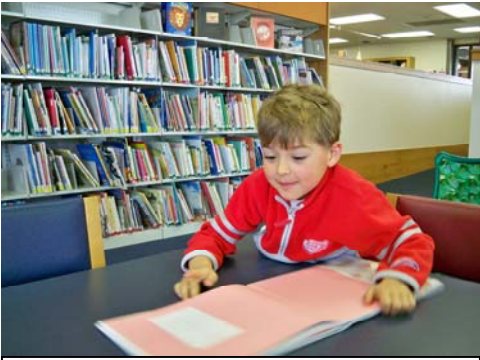
Don’t you wish you could see what he does?