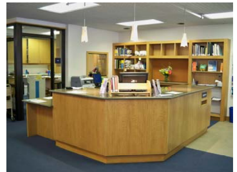
Gorgeous blue carpeting being laid. And now, the volunteers are back to work putting all the books back on the shelves. WOW, how beautiful the new library is!! THANKS EVERYONE!!