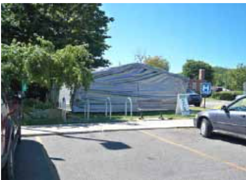
All set and ready to go for the next day’s “Friends” Annual Book Sale. Those who love reading can’t wait to see what is inside that tent!

We will keep you posted with the latest developments in this exciting project. It is so interesting to go back in history and read about what our community was like years ago.