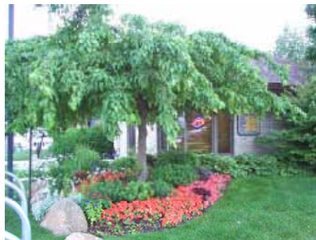
The grounds of the library have been beautiful with an ever-changing display of colorful flowers for everyone to enjoy.