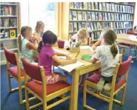
The Young Writers Group (ages 8-8th grade) met during June and July learning to use their imagination in creative writing.

This is such a wonderful gift to the community, researchers, and those just interested in the history of the area.