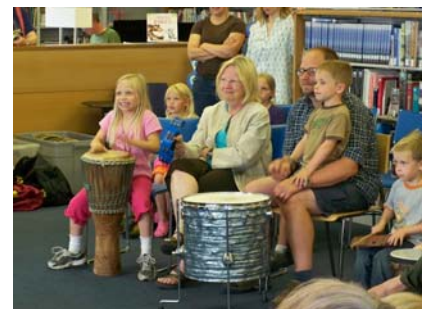
Drummuny was a lively experience enjoyed by both children and adults.

BSDL will be closed at 5:00 p.m. on Wednesday, November 23rd, and for the entire day on Thursday, November 24th to celebrate Thanksgiving.