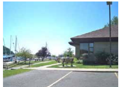
Benzie Shores District Library on a beautiful sunny day. What a wonderful view of Betsie Bay with the boats moored there during the summer.