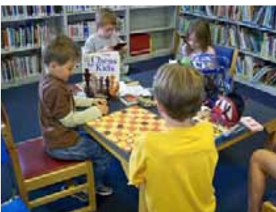
The summer Gaming program provided fun with other children, and included many different games like checkers and chess.