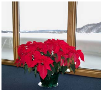
Notice the depth of the snow drifts on the library's deck. An early snowstorm left at least fourteen inches of the beautiful "white stuff."