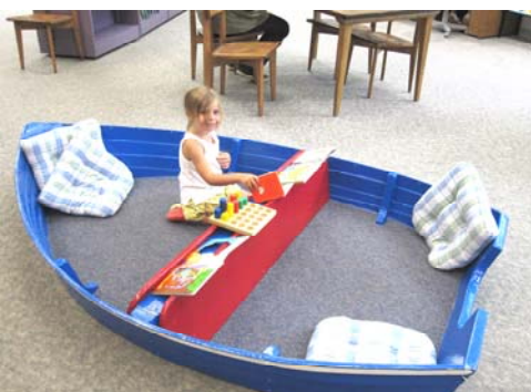
Benzie Shores District Library’s children’s area boat is now being enjoyed in its new home at the library in Marshall, Michigan.

Researchers should please note that our newspaper collection will be unavailable until the project is finished sometime this summer.