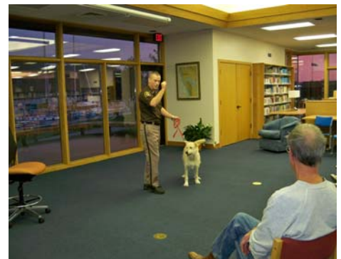
Chase Turner (Hilary's dog) is enjoying being the star of the September 1910 Reflections by the Bay program given by Troy Packard .