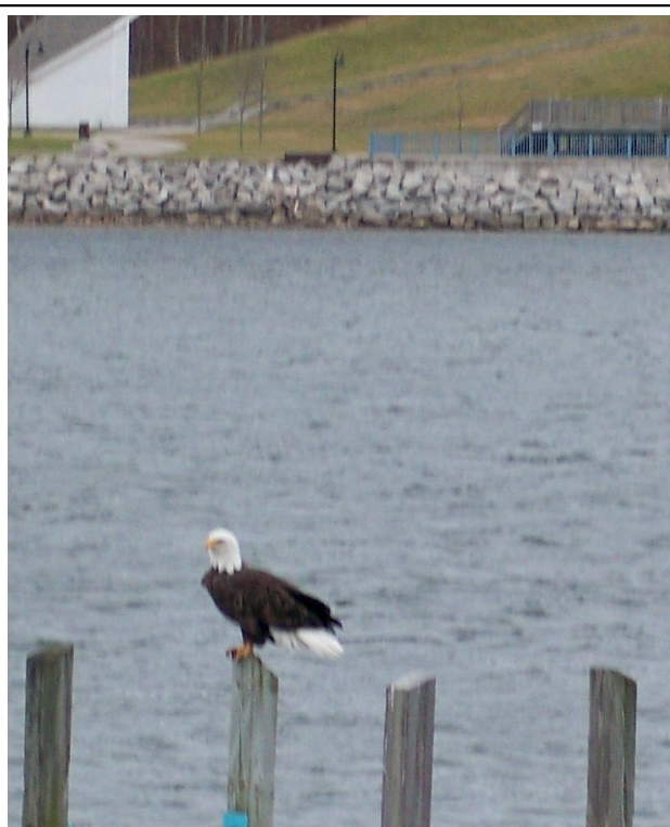
Meet "Otis" our new friend who sits on the dock of the bay. He has been spotted numerous times out our window. Once, he even came to storytime!