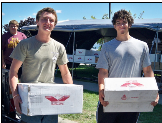
Frankfort football team players take a break from practice to help unload book boxes.