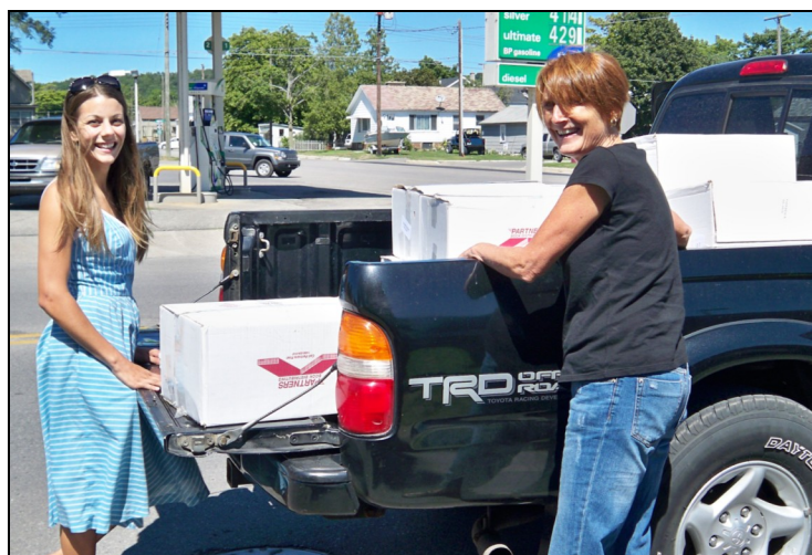
Unloading boxes from one of the 19 truckloads.

The Friends are able to provide all of this through membership dues, memorials and donations, public computer printing fees, the on-going book sale, the annual book sale, and book bag sale. If you are interested in becoming a Friend of the Library, the membership form is available on-line or in the library.