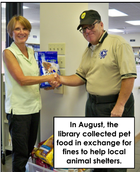
In August, the library collected pet food in exchange for fines to help local animal shelters.

It is quite a task running a library. We have a large circulating collection with digital and print materials to maintain. We have computers in constant need of updates. When things break, we fix them. We make connections with the community. We have stories to share and puppets to bring to life. We are your librarians.