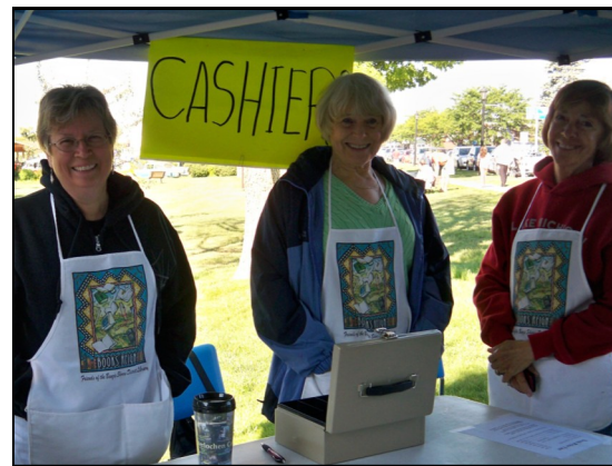
Volunteers having fun helping at the book sale.