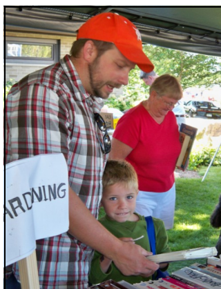
Too many books to choose!